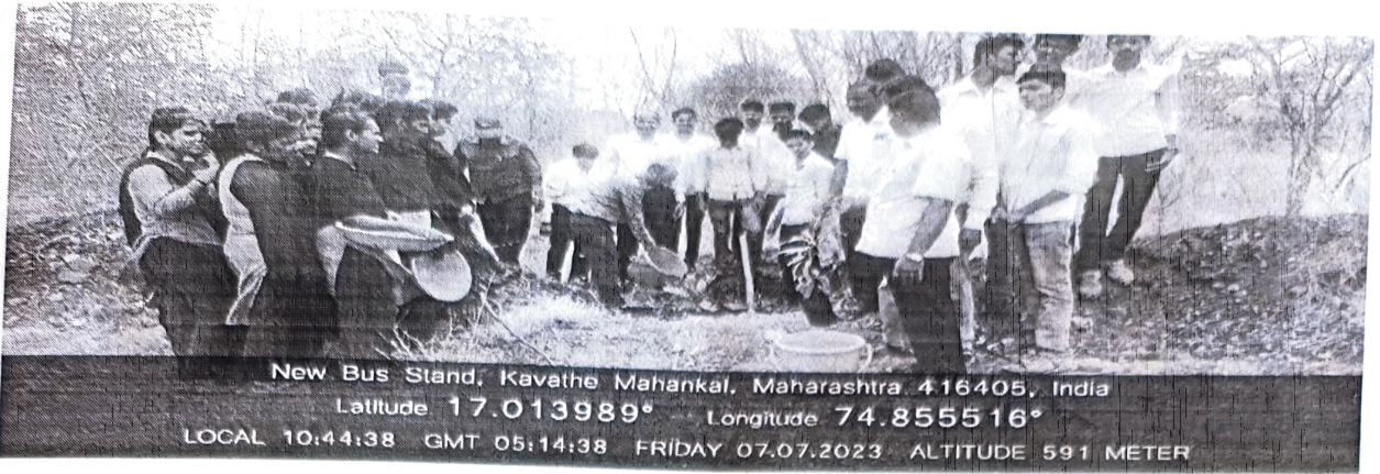
New Bus Stand, Kavathe Mahankal, Maharashtra 416405, India Latitude 17.013989° Longitude 74.855516° LOCAL 10:44:38 GMT 05:14:38 FRIDAY 07.07.2023 ALTITUDE 591 METER