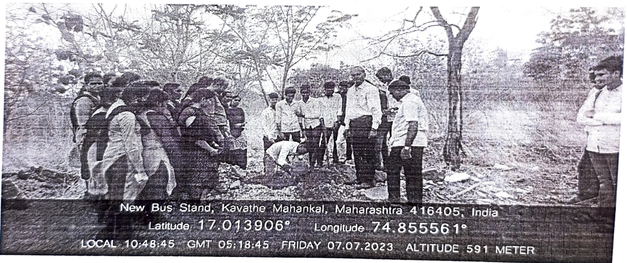
New Bus Stand, Kavathe Mahankal, Maharashtra 416405, India Latitude 17.013906° Longitude 74.855561° LOCAL 10:48:45 GMT 05:18:45 FRIDAY 07.07.2023 ALTITUDE 591 METER